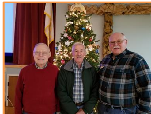
Congratulations Door Prize Winners