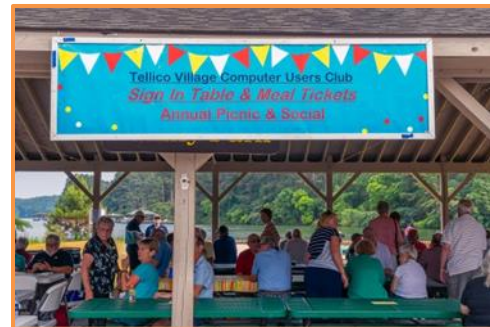
TVCUC Annual Picnic set for June 2, 2020

Keep up with latest club news and events by visiting our website. You can find us at https://www.tvcuc.org . See below for upcoming meetings and tour events.