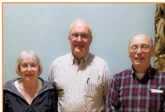
February Door Prize Winners