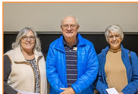
Door Prize Winners