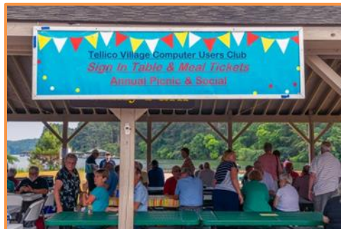
TVCUC Annual Picnic set for June 2, 2020